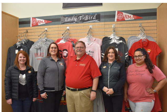
New Mexico Junior College bookstore staff

Campus student database system (ERP): Banner