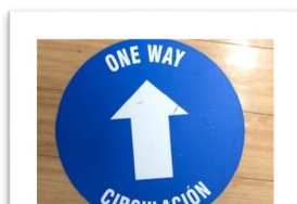
Non-slip floor decals helped with traffic flow.

We saw a decrease in sales in all categories, but with a 9% decrease in enrollment we were not surprised.