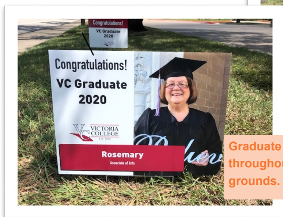
Graduate signs posted throughout the campus grounds.